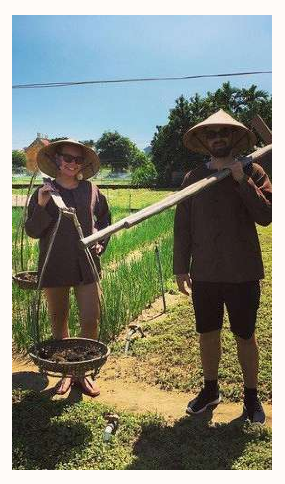
Day 9 - Hoi An. Become a Hoian person in countryside activities

You will spend some hours to explore the Cam Thanh, the seven-acre palm forest near Hoi An Town by local small boat and Tra Que vegetable village nearby. To spend a real life in TraQue vegetable village, come here early in the morning, when the farmers just start watering vegetables in the morning and harvesting vegetables to bring to the market. Coming to TraQue vegetable village is not onlyto see vegetables, you can interact with the farmers here, ask them to harvest together, try the experience of watering vegetables. In addition, walking, cycling or even trying to ride a buffalo, walking between the fragrant streets of vegetables is also very interesting.