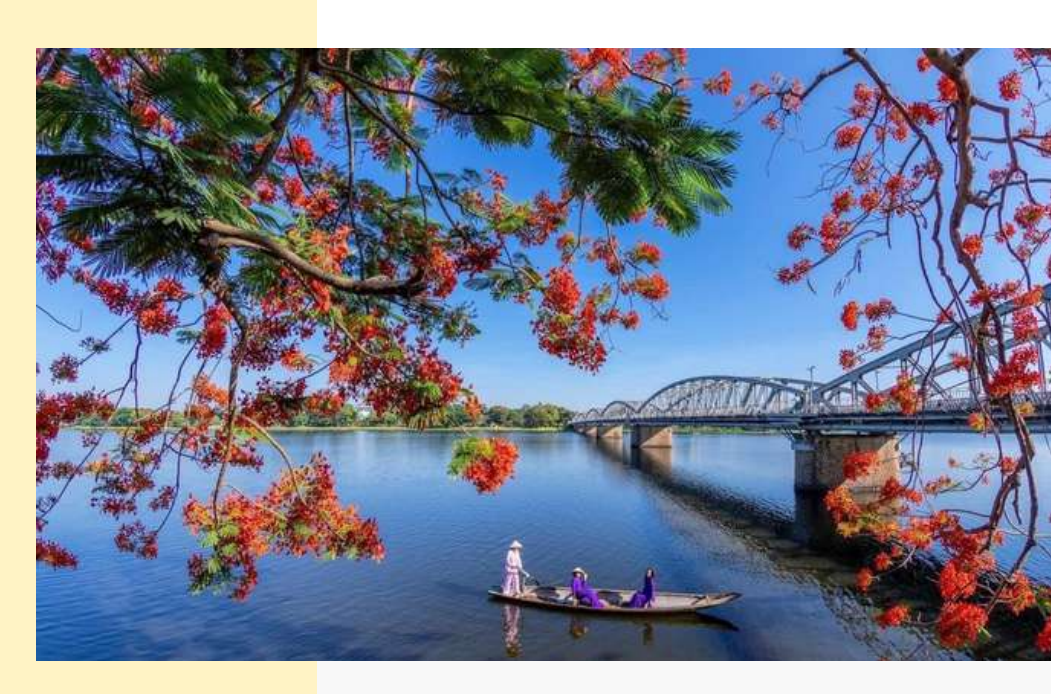
Day 6 - Hue. Culture and cuisine, relax and yoga course

Spend your time relaxing in the peaceful, quiet resort on the bank of the tranquil and picturesque Nhu Y and Perfume rivers. From the hotel's windows and balconies, you will admire the rural landscape, and fishermen's activity in the river and will have meals in their green biodynamic gardens. You may choose a cuisine cooking, yoga, or meditation course.