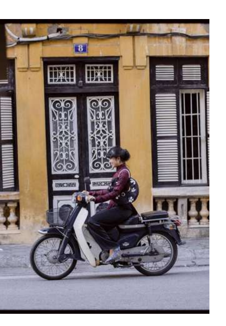
Day 13 - Hochiminh city. End tour trip

Meal provided: Breakfast Accommodation: None