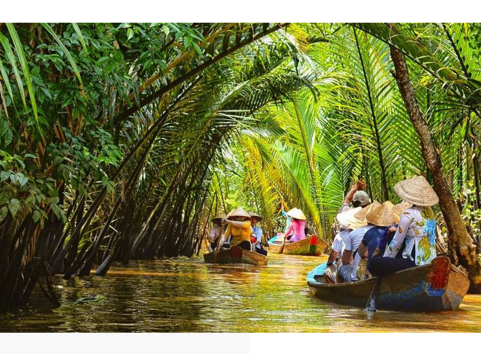
Day 12 - Mekong Delta. Floating market in Can Tho. Spa retreat, yoga or meditation courses (Option)

Morning in Can Tho, you will begin with a gentle trip through the picturesque canals and waterways in a small boat, taking in the sultry scenery and daily activities of the small boat vendors of the floating markets who live along these Mekong canals, as well as stopping at the spectacular Cai Rang floating market, one of the most famous crowded floating markets in Mekong Delta river's region. This is a wholesale market in buying and selling goods on the river, especially fresh vegetables, tubers and tropical fruits. Afternoon is the relax time for spa, yoga or meditation course.